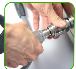
STAINLESS STEEL QUICK CONNECT