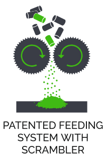
PATENTED FEEDING SYSTEM WITH SCRAMBLER