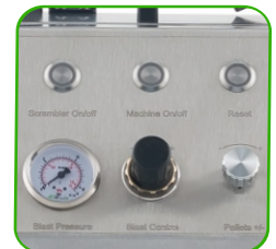
PRESSURE CONTROL, DRY ICE CONSUMPTION CONTROL