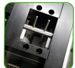
ANTI - CLOGGING SYSTEM