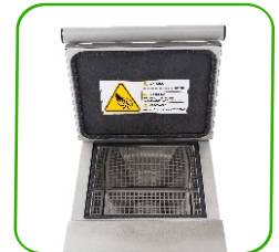
INSULATED HOPPER (31 KG CAPACITY)