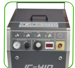
USER FRIENDLY CONTROL PANEL