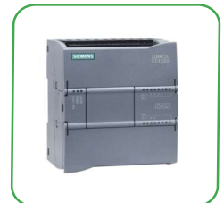
ADVANCED CONTROL MODULE SIEMENS S7-1200